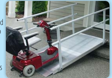
Shown with Optional Handrails

Designed for safety and engineered for reliability, the PATHWAY® ramp is extra wide and heavy-duty enough to withstand the harshest of use and conditions. Available with or without handrails. Features a built-in non-skid driving surface. 36" bariatric width, 850 pound bariatric weight capacity. Additional widths and lengths available.