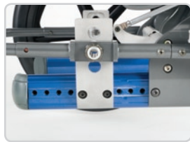
Adjustable axle and seat position