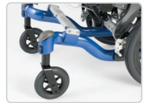
Variety of caster and wheel sizes

Seat width (adjustable) 13" – 20" Seat depth (adjustable) 15" – 20" Seat height (adjustable) 13" – 20" Back angle (adjustable) 90° – 120° Back height 20" and 25" Dynamic tilt 50°