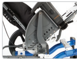
Adjustable seat depth and back rest Optional transit tie-downs