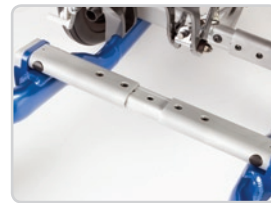
Adjustable chair width