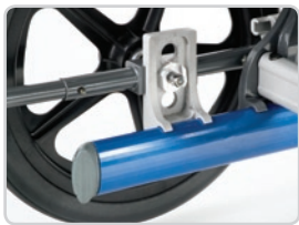
Adjustable seat height

TREND-SETTING FRAME COLORS. YOU CAN ORDER CUSTOM COLORS TOO. CONTACT US FOR DETAILS.