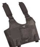
Full Torso Support Vest