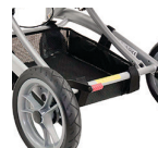
Medical Necessity Storage Basket