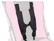
H-Harness with Padded Covers (Transit Required)