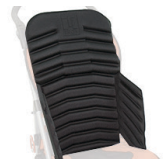
Reducer Seat Insert