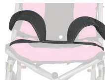
Medial Thigh Support (Abductor)