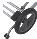
Rear Anti-Tip Tubes