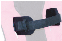
Adj. Firm Lateral Trunk Support