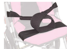
Lateral Thigh Support (Adductor)