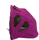
Extended Headrest Cover with or without windows (Canopy)