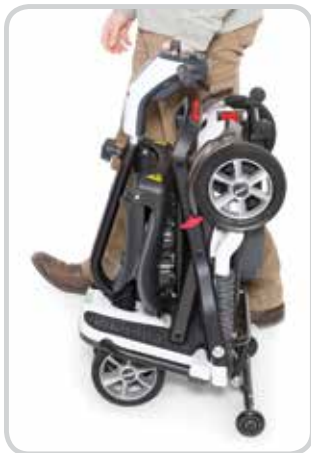
Easy to Transport