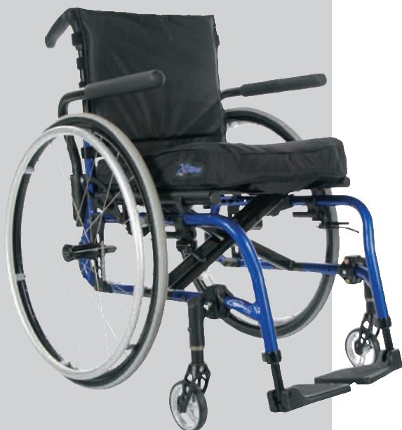
Quickie 2 Lite Fixed Front