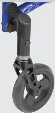
Redesigned Caster Housing