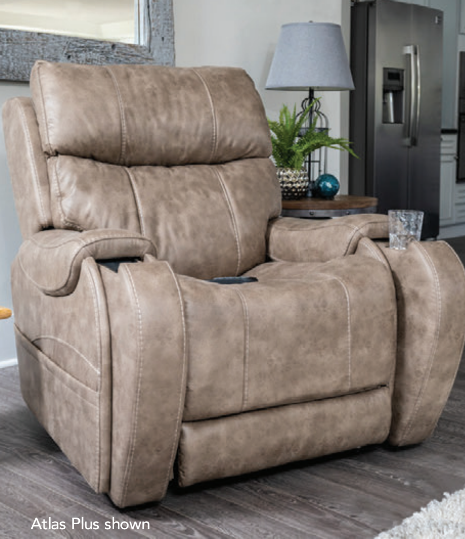
Atlas Plus shown