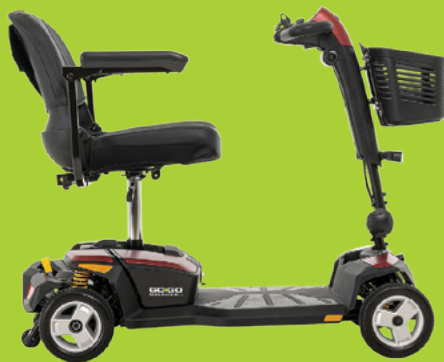
GO GO® ENDURANCE Li

6.7 KM/H TOP SPEED 21.3 KM RANGE (with 90 kg user weight and and 16 Ah MAXX battery) 325-LB. WEIGHT CAPACITY