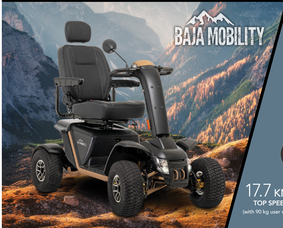
BAJA™ WRANGLER® 2